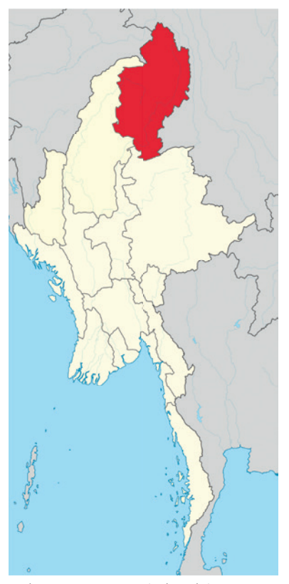
Kachin State in Myanmar.

Myanmar has recently seen positive governmental initiatives and promises in the drafting of a bill amending the 1993 narcotic drugs and psychotropic substances law to eliminate lengthy prison penalties for simple drug use (Drug Policy Advocacy Group DPAG, 2017). The